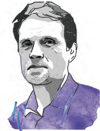
BY MATTHEW TAYLOR

Finance professionals need to be part of a wider transformation that is shaking up the role and purpose of government