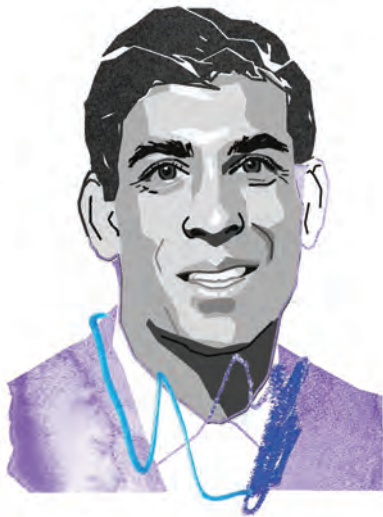
BY RISHI SUNAK

The government is committed to helping council leaders create agile digital services that serve citizens and bring down costs