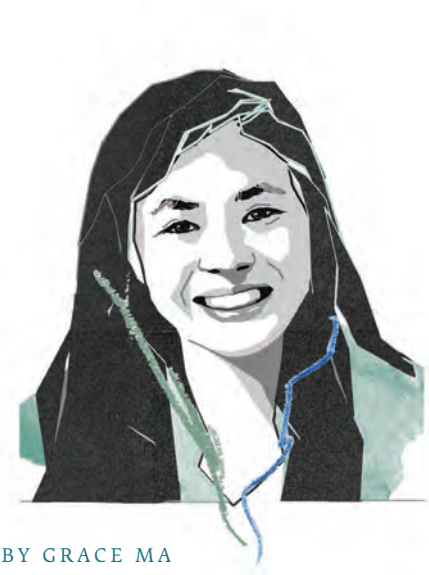
BY GRACE MA

Blockchain technology has great potential for public services – but it is not a silver bullet