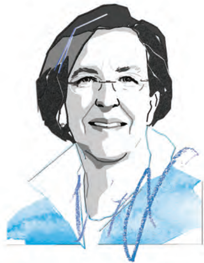
BY JUNE MATTE

The US city of Pittsburgh was forced by necessity to undergo technological transformation. How was it done?