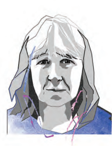
BY CHRISTINA THOMPSON

Lambeth Council is using cloud technology to transform the way it delivers services